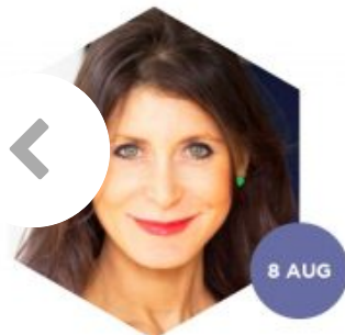
Internet Tips and Traps