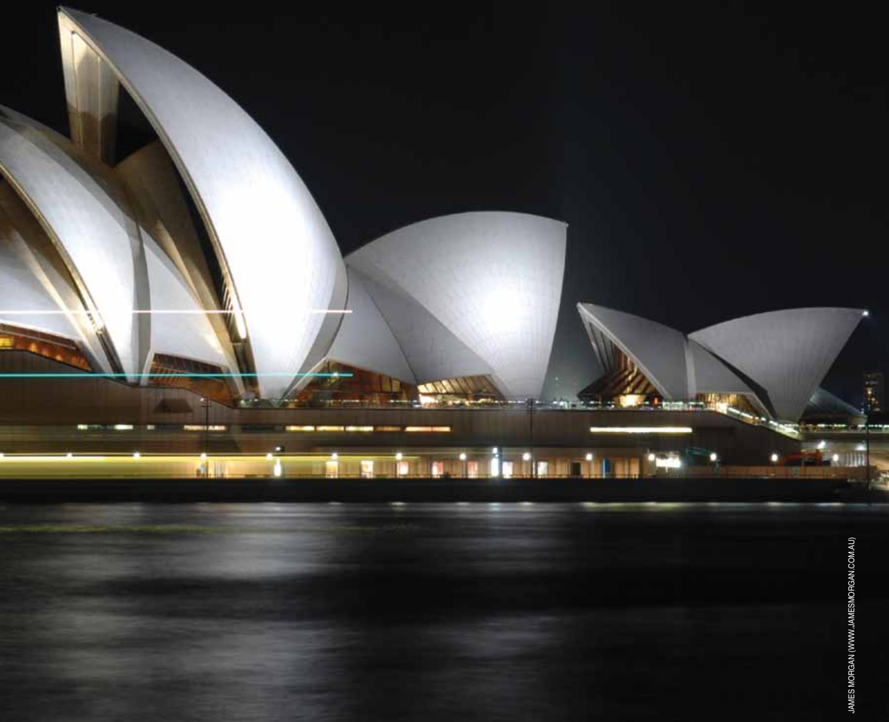
JAMES MORGAN (WWW.JAMESMORGAN.COM.AU)

(as at July 2013). (See http://services.unimelb.edu.au/venuehire/general/weddings ). So do not take professional photographs in public places – not without carefully checking the rules first!